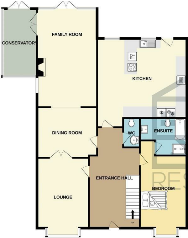
GROUND FLOOR 1566 sq.ft. (145.5 sq.m.) approx.